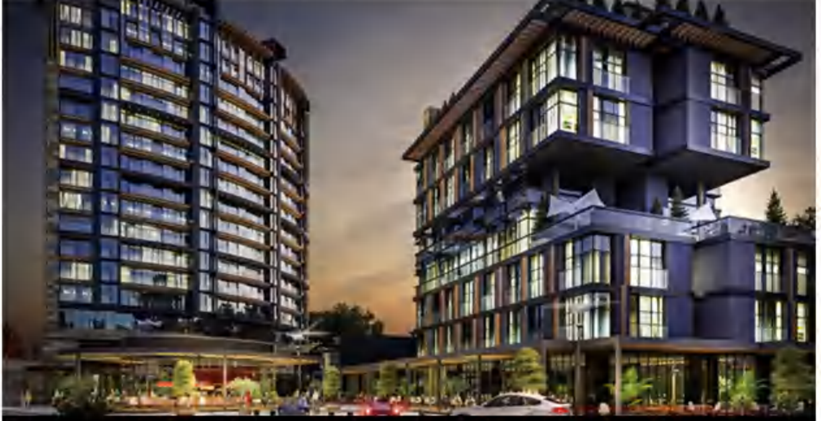
ELYSIUM ELIT KOŞUYOLU